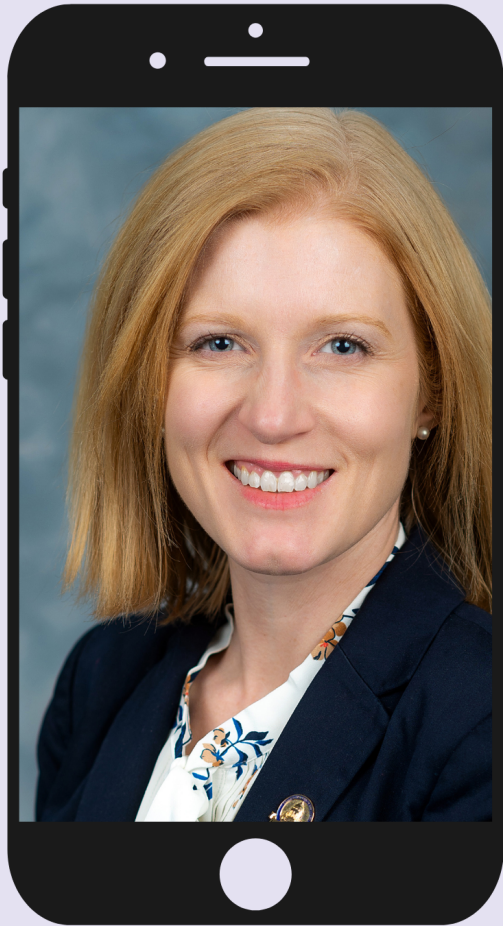
Cassie Chambers Armstrong

Join us for an empowering session with Cassie Chambers Armstrong as she explores the vital role of virtual technology in providing court access for survivors of domestic violence and other marginalized groups. This talk will illuminate the importance of ensuring safe and convenient access to the justice system for those who need it most.