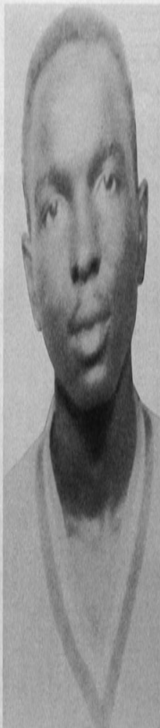
MICHAEL HENRY SCHWERNER